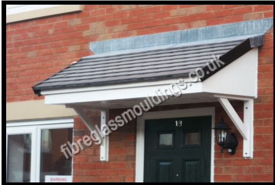
After traditional tiles are fitted