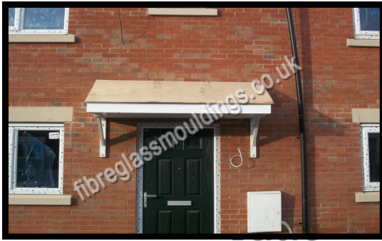
Before traditional tiles are fitted