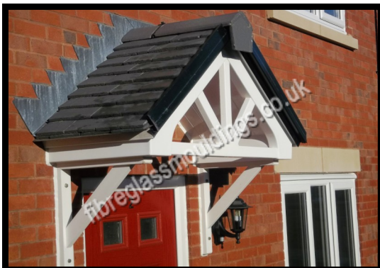
After traditional tiles are fitted