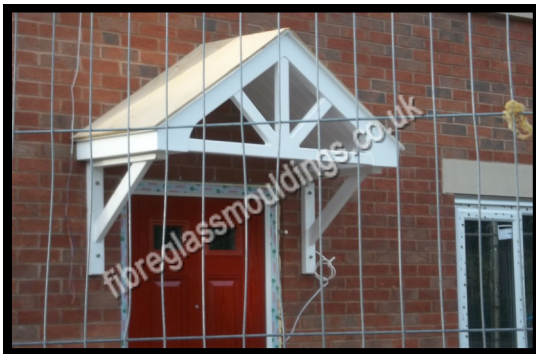
Before traditional tiles are fitted